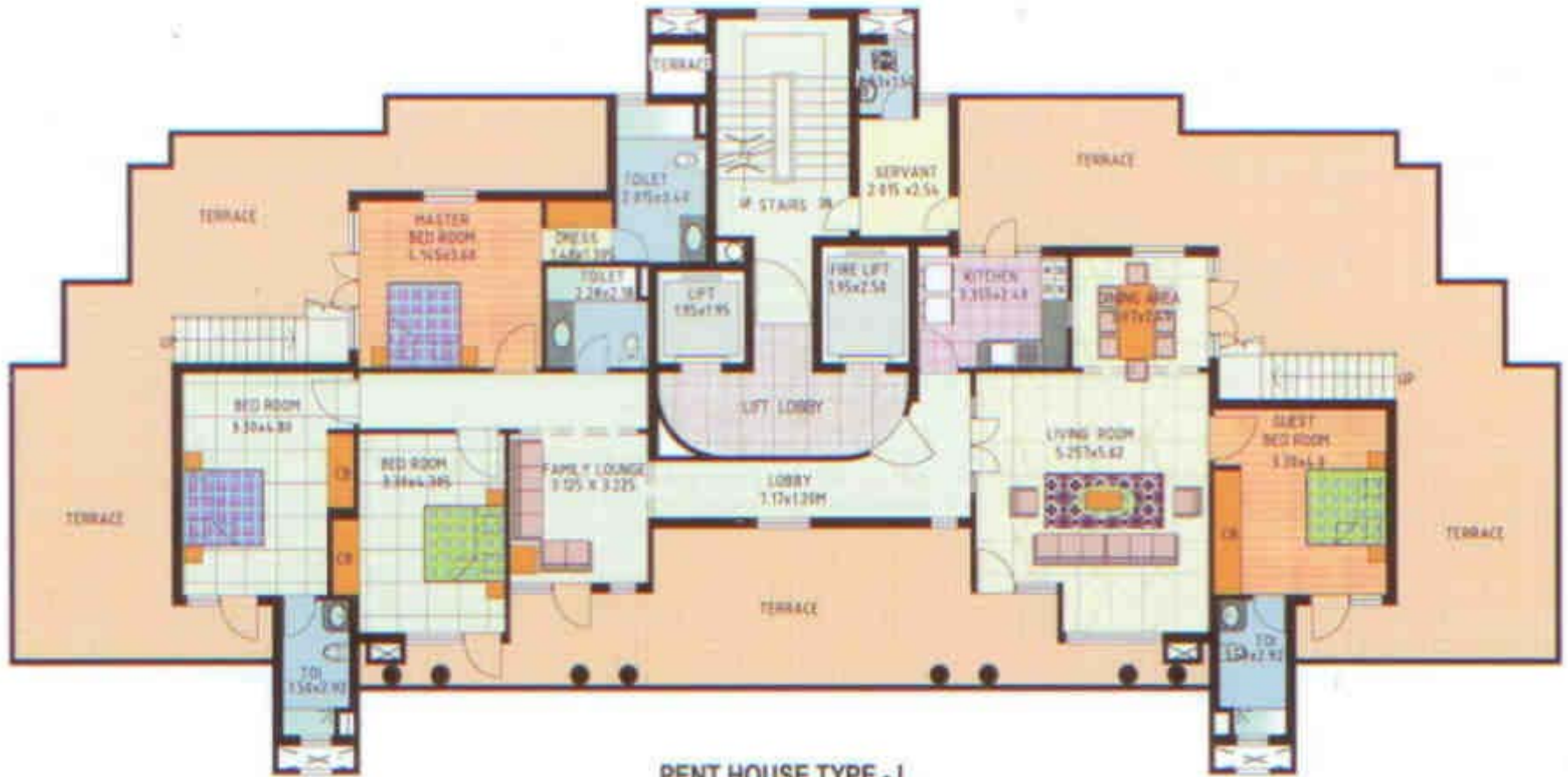
PENT HOUSE TYPE - I