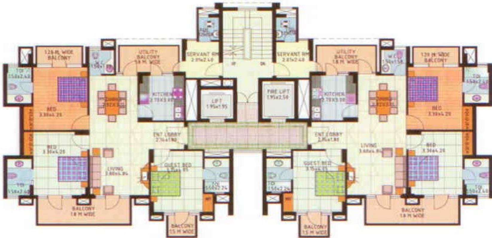
THREE BED ROOM TYPICAL FLOOR PLAN