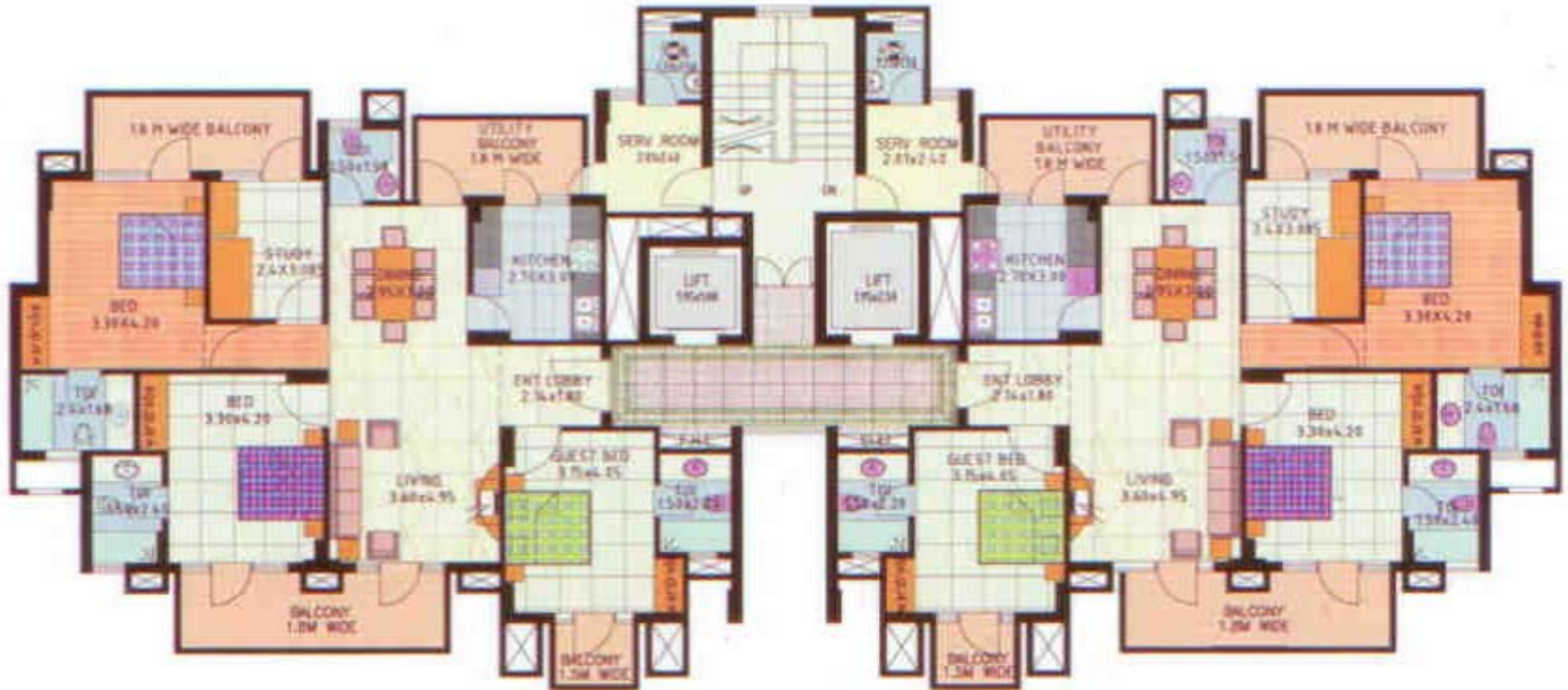
THREE BED STUDY TYPICAL FLOOR PLAN