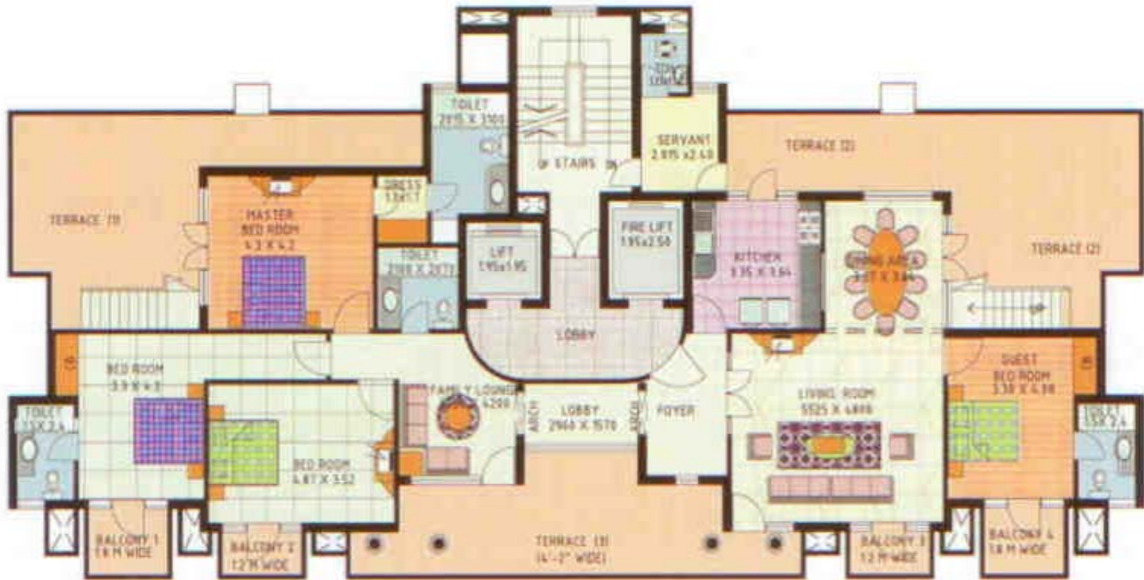
PENT HOUSE TYPE -II SUPER AREA = 4683 sqft