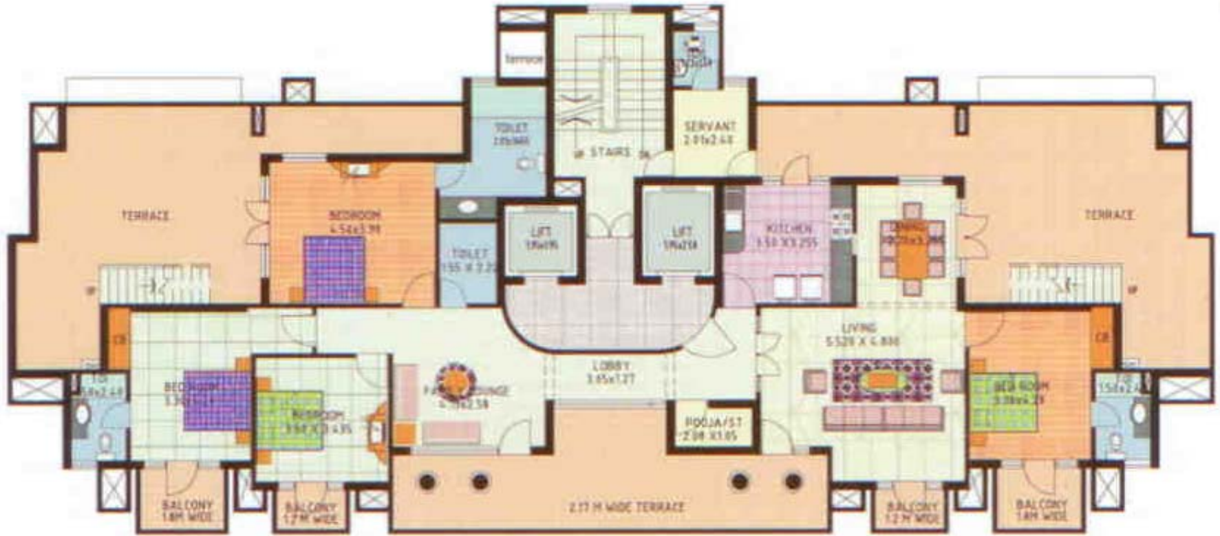
PENT HOUSE TYPE -III SUPER AREA = 5324 sqft