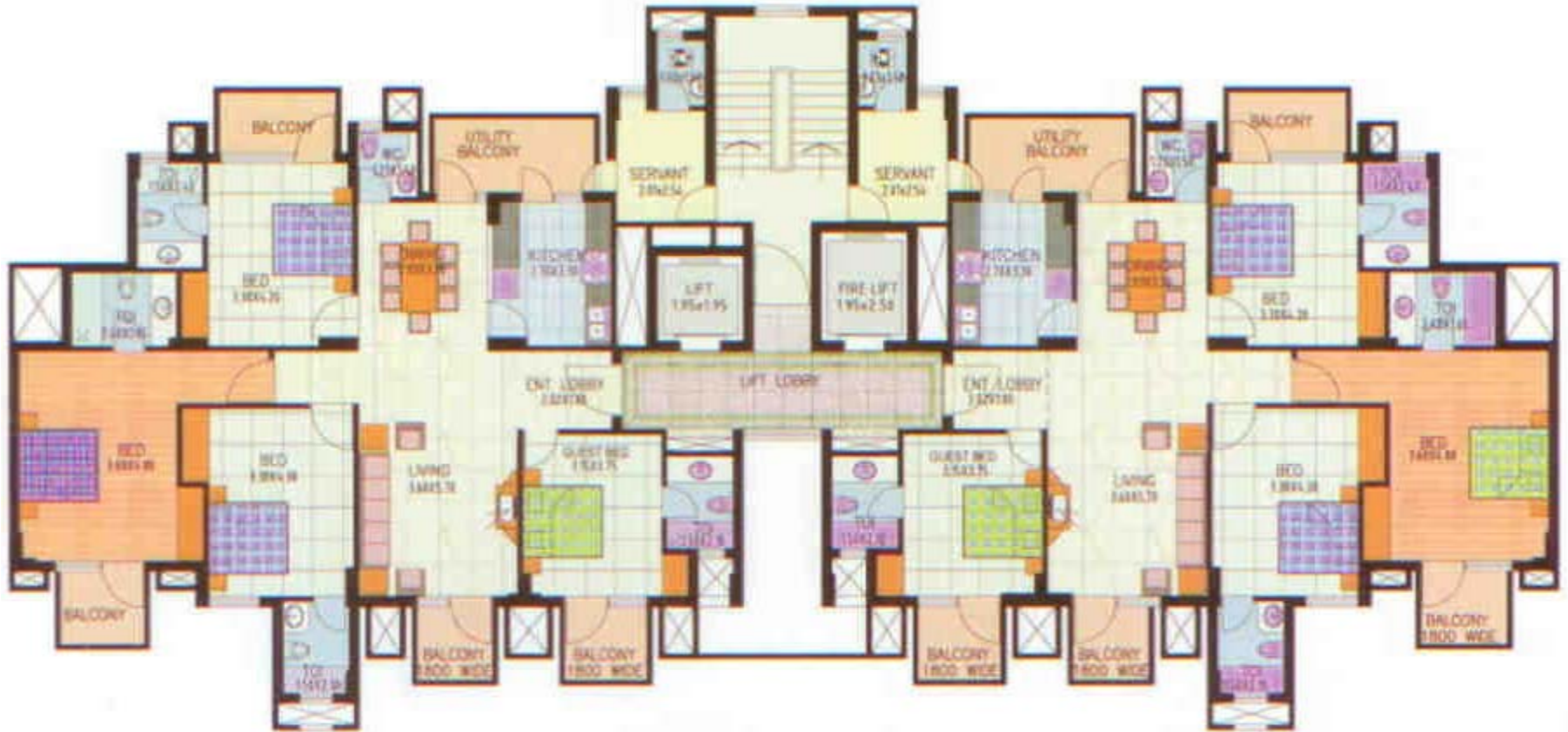
FOUR BED TYPICAL FLOOR PLAN