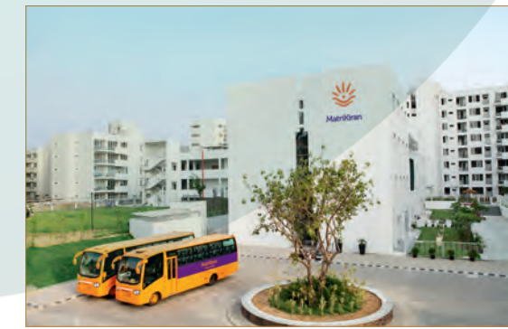
MATRIKIRAN · Sohna Road

WESTIN HOTEL The Westin Gurgaon, New Delhi, is located in the city's growing business and entertainment district. The Westin Hotels & Resorts® offers you the most premium hospitality in the country and 5 star services with a difference.