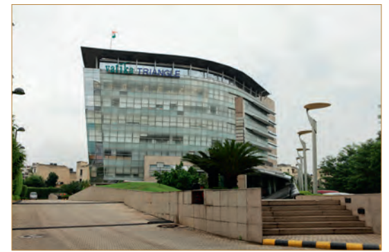
VATIKA TRIANGLE · Gurgaon