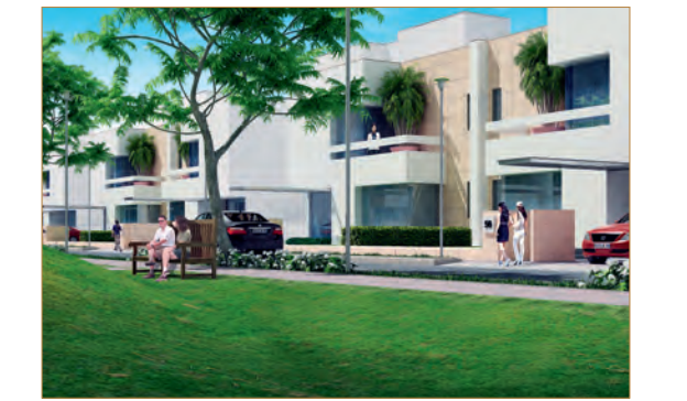
SIGNATURE VILLAS · Vatika India Next