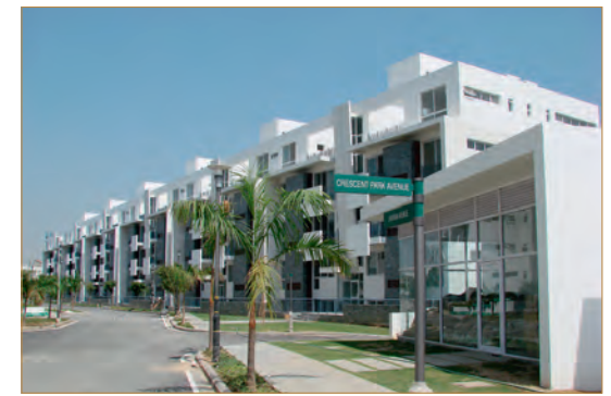
VATIKA CITY · Gurgaon