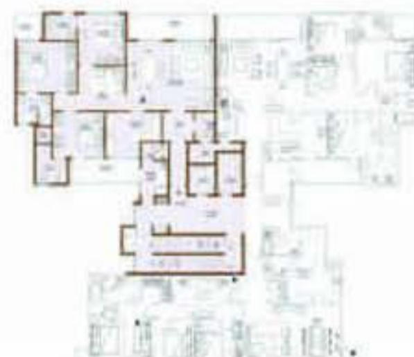
Tower B Type A - Garden Facing 3 bedroom apartment Approx. Super Area 2350 sq. ft.