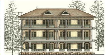
Silverglades Hill Homes*