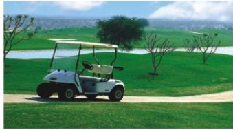
Classic Golf Resort*