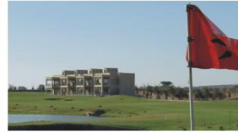
Tarudhan Valley Golf Resort