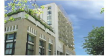
The Peach Tree*