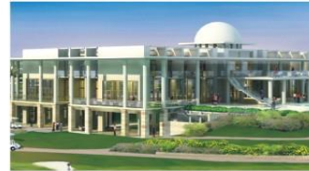
The Imperial Golf Estate*