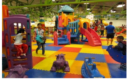
DEDICATED PLAY AREAS FOR CHILDREN