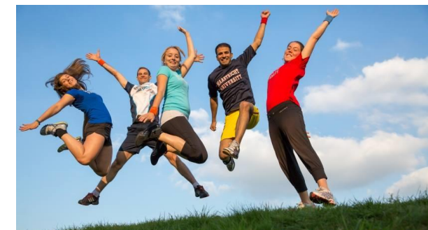
SPORTS & RECREATIONAL FACILITY