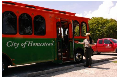
COH HOMELAND SECURITY