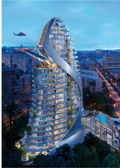
MICHAEL SCHUMACHER WORLD TOWER