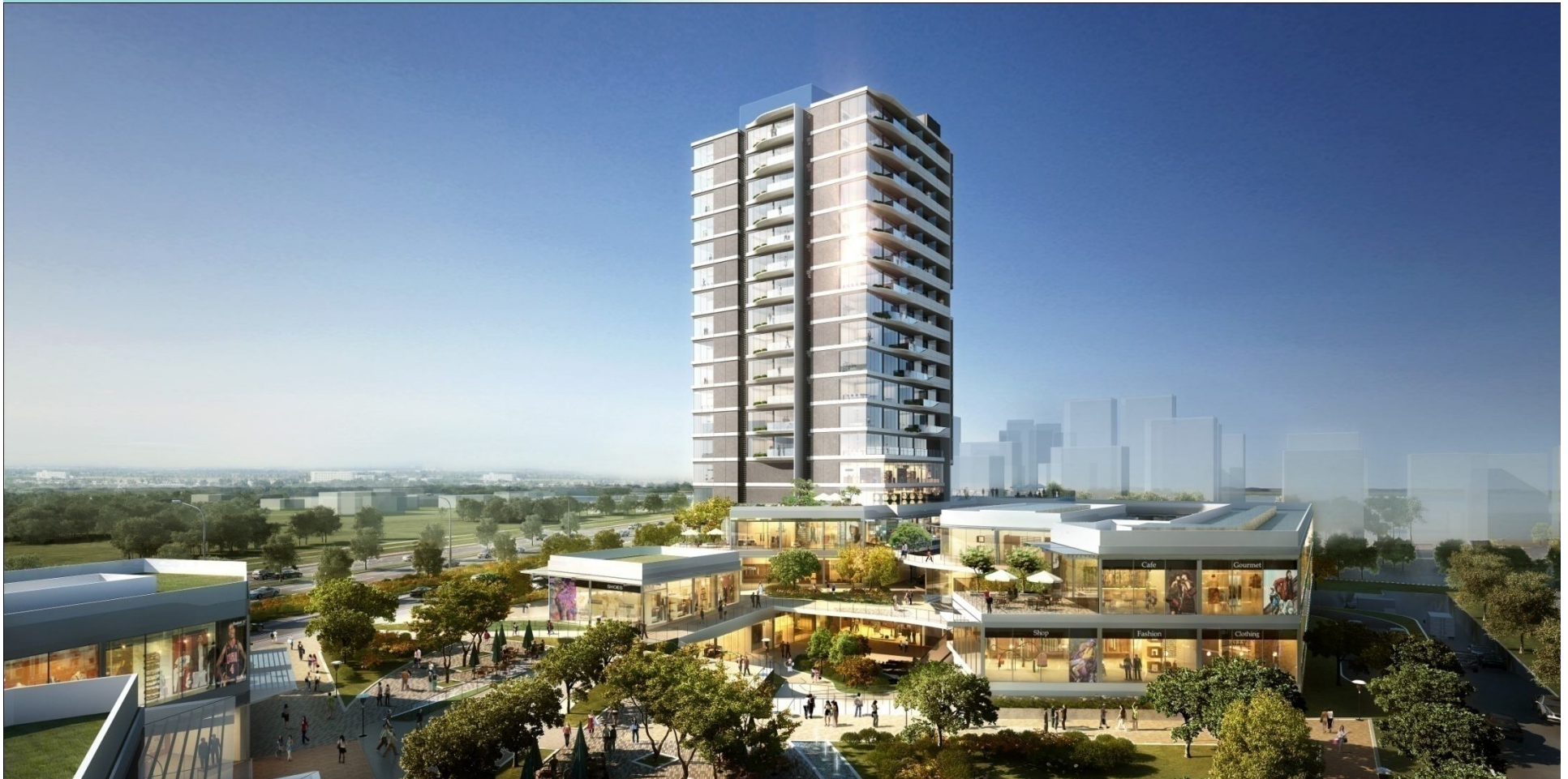
Actual 3D Perspective - Day View