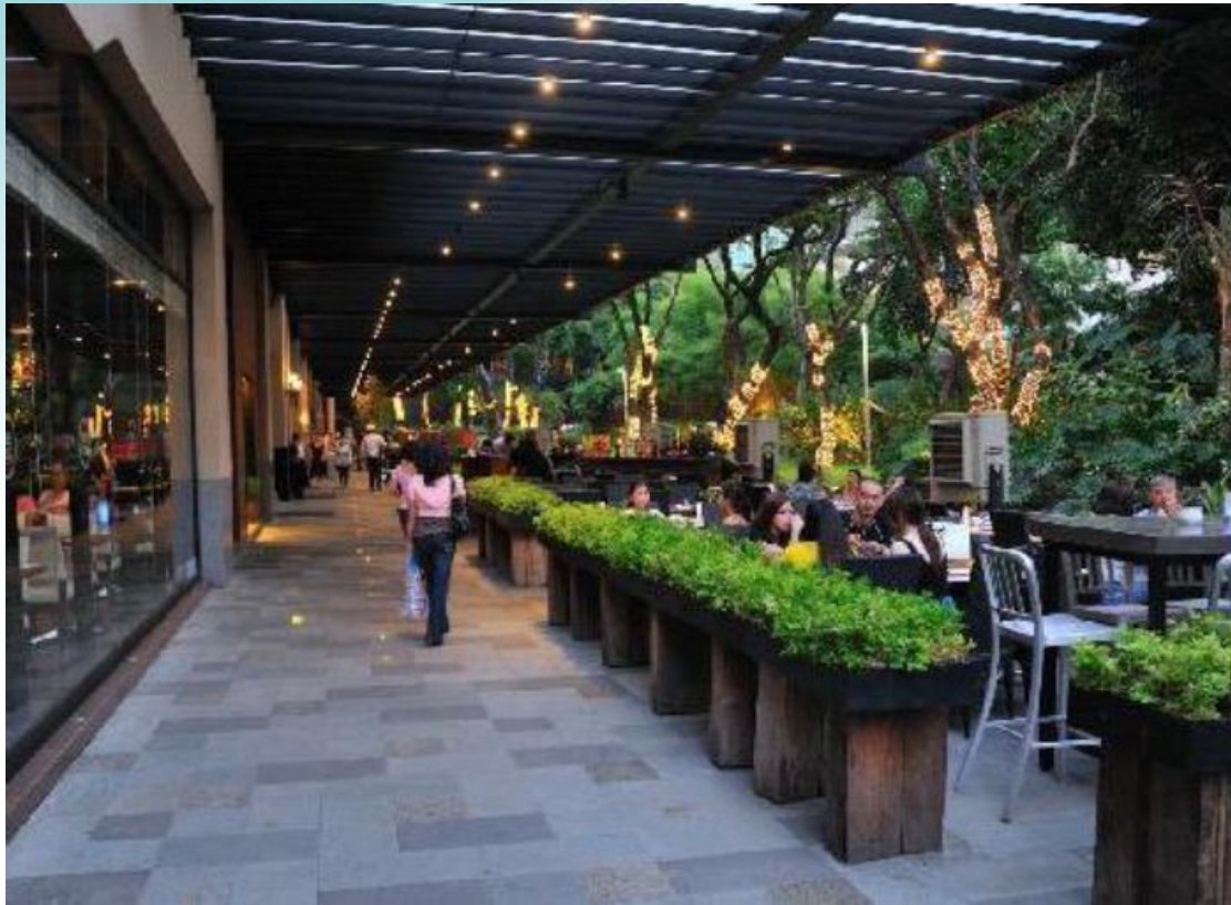
Retail mood shot showing covered walkways