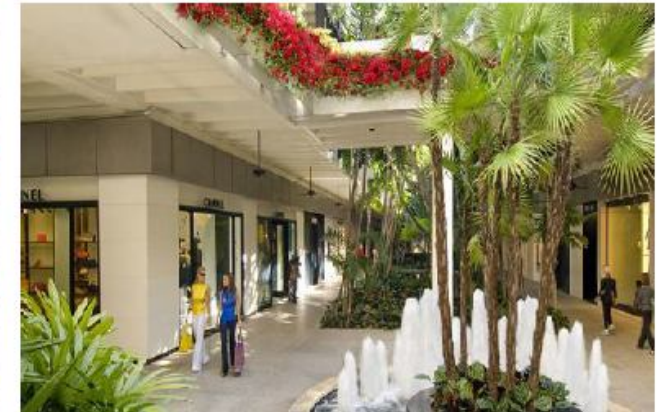
Retail mood shot showing landscaped courtyards, passages