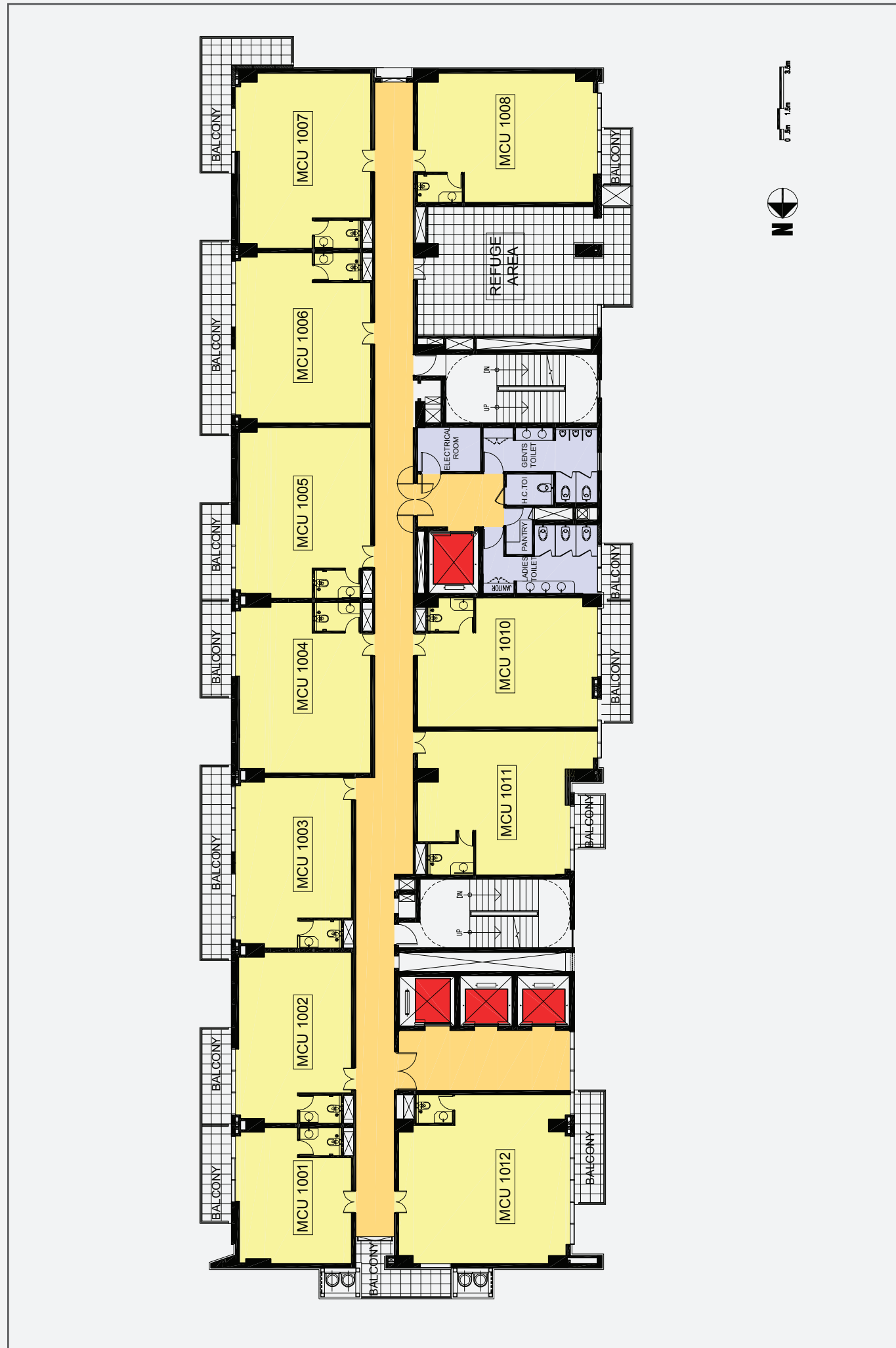
FLOOR PLAN - 10 TH FLOOR