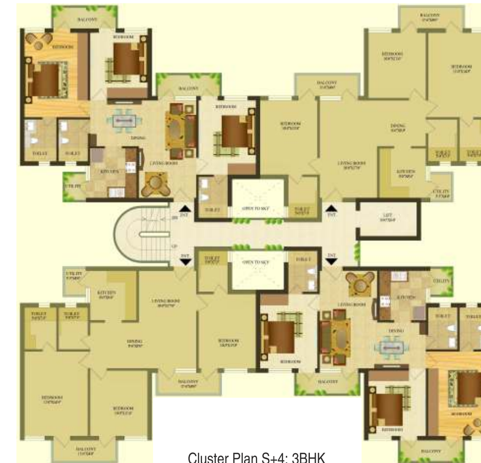
Cluster Plan S+4: 3BHK