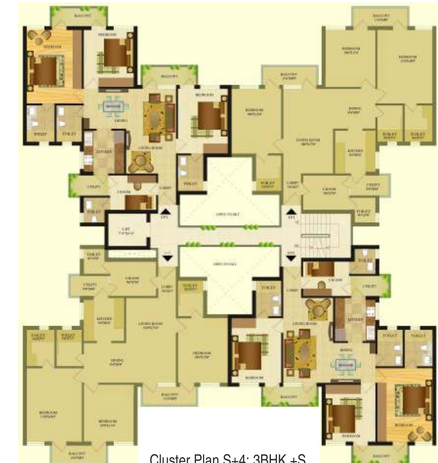
Cluster Plan S+4: 3BHK +S