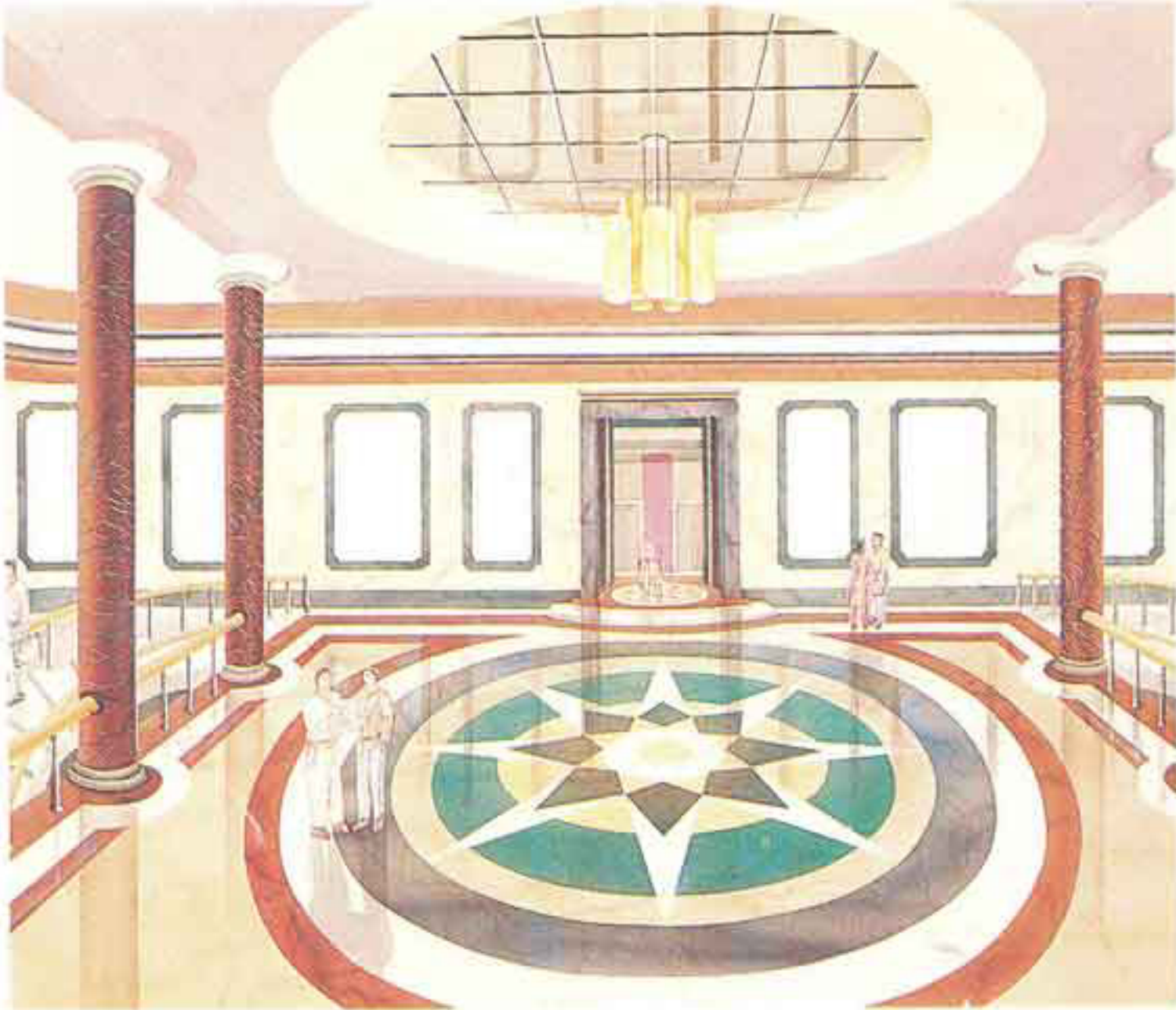
An artist's impression of the grand entrance lobby of DLF Richmond Park

Drop in at the DLF office today. Check out the options.