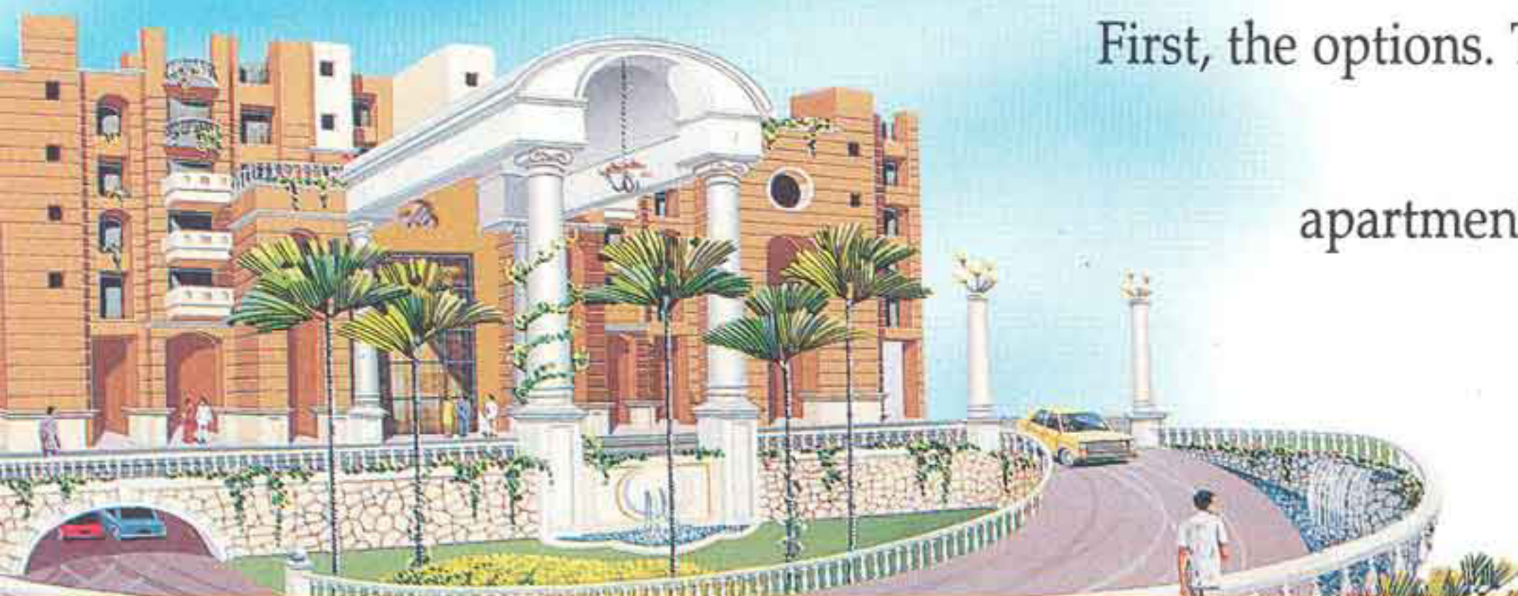
An artist's impression of the entrance porch of DLF Windsor Court, with a cut-section of the apartment block that also shows the first four floors.

First, the options. Two of the most exclusive apartment complexes ever, both in